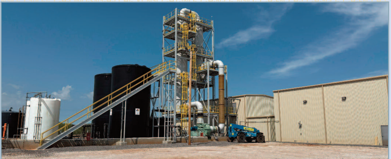
Iosorb® plant IO#10, Western Oklahoma, USA